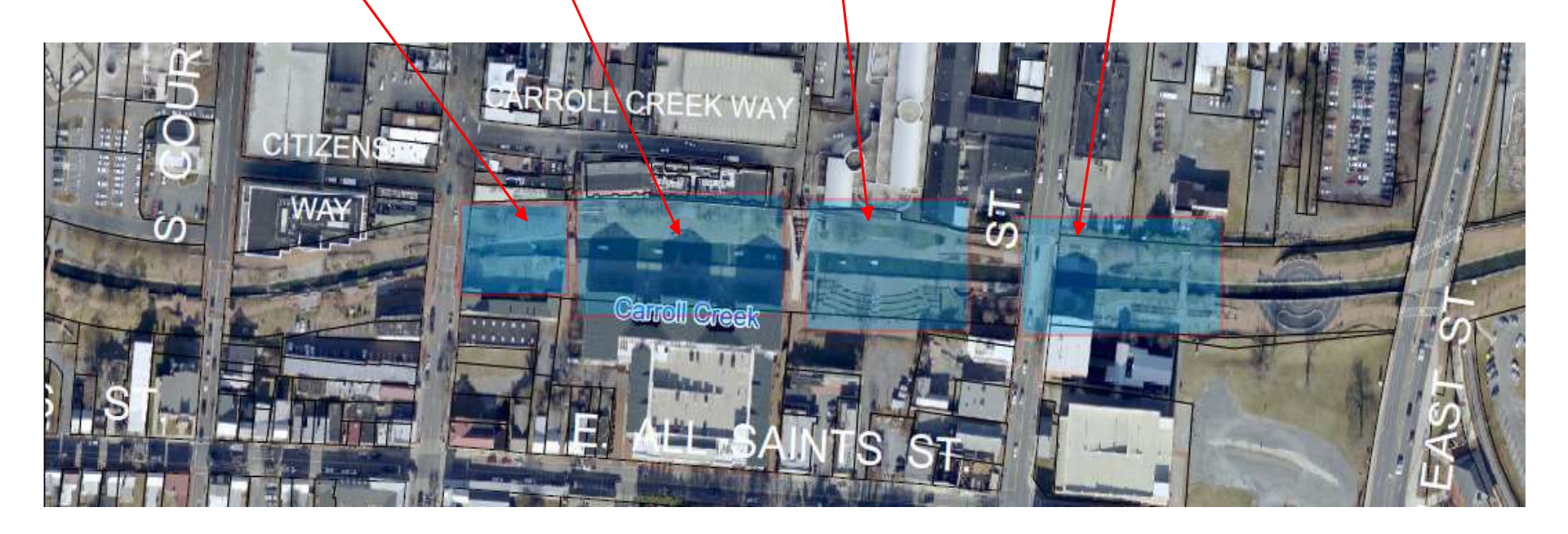
Zone 4: East Street Bridge Water Feature Union Mills Retail